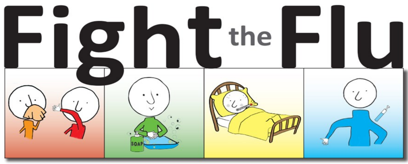
Cover your cough.